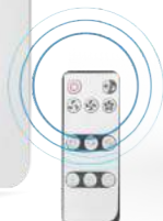
MODEL TAE 501