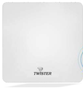
MODEL TAE 502